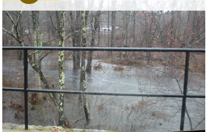
Roadside Flooding in Brookline

Climate Change and Energy Efficiency – identify opportunities to save energy and costs and reduce risks to our communities, businesses and citizens. How can we reduce dependence on outside sources of energy, construct homes and buildings that are more efficient, and reduce impacts to our communities and infrastructure from extreme storms and flooding?