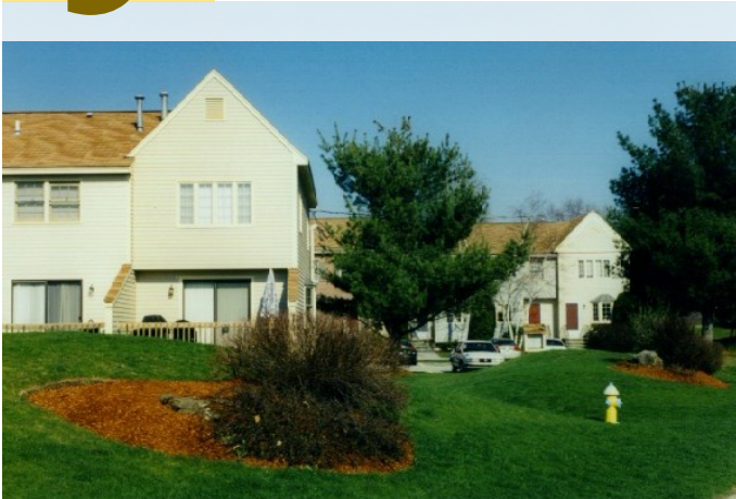
Condominiums in Hudson

Housing Choices— ensure that everyone, no matter what their income level, has convenient and affordable choices in where they live. This includes a variety of housing options and ownership types that appeal to people at any stage of life and is convenient to where they work, shop, and play.