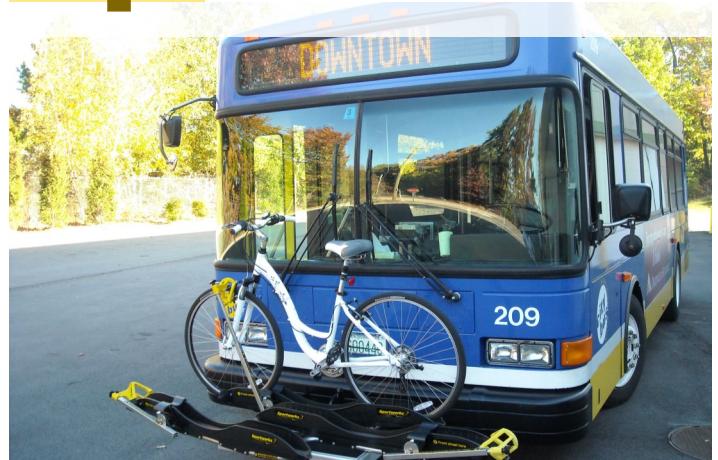
Nashua Transit Service Bus

Transportation Choices – provide a number of options that help people safely and efficiently get where they need to go, whether it is by walking, driving, biking, public transportation, carpooling, or taking a train or plane. Transportation networks should make it easy to get from one place to another, and should also allow the efficient movement of goods to support the economy (commercial freight, rail, and air transport).