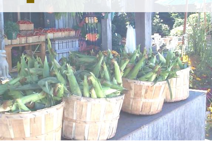
Farm Stand in Hollis