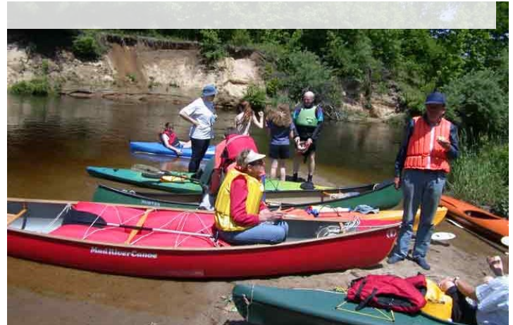
Paddling in the Souhegan River

Community and Economic Vitality – continue to make New Hampshire a great place in which to do business, raise a family, recreate, visit, and retire. Our neighborhoods and communities offer opportunities for an excellent education, good health, cultural happenings, and social connections.