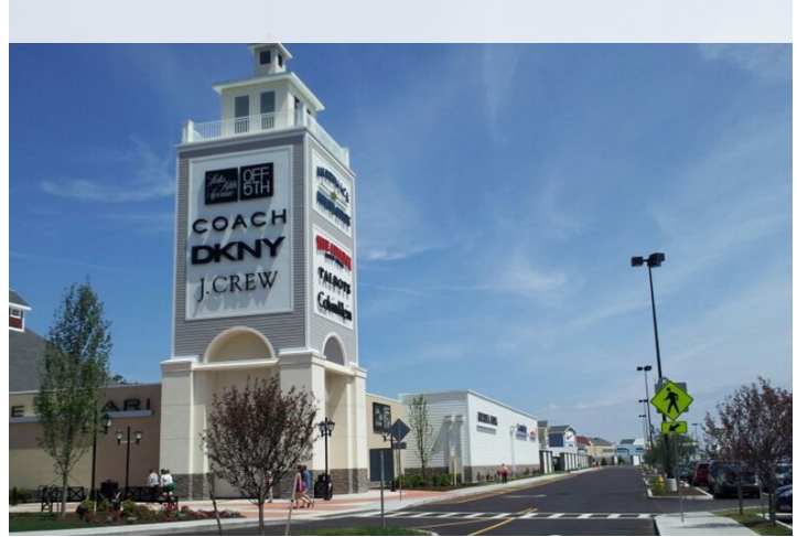
Merrimack Premium Outlets

All NRPC Communities mention diversifying the tax base in their Master Plans