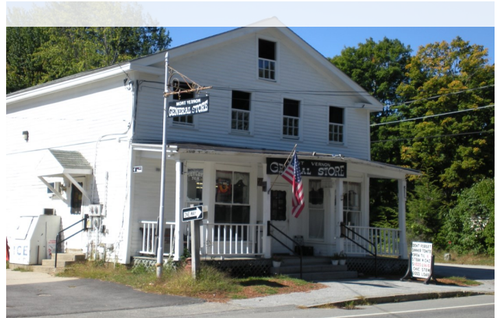
General Store, Mont Vernon

All NRPC Communities mention encouraging business development in their Master Plans