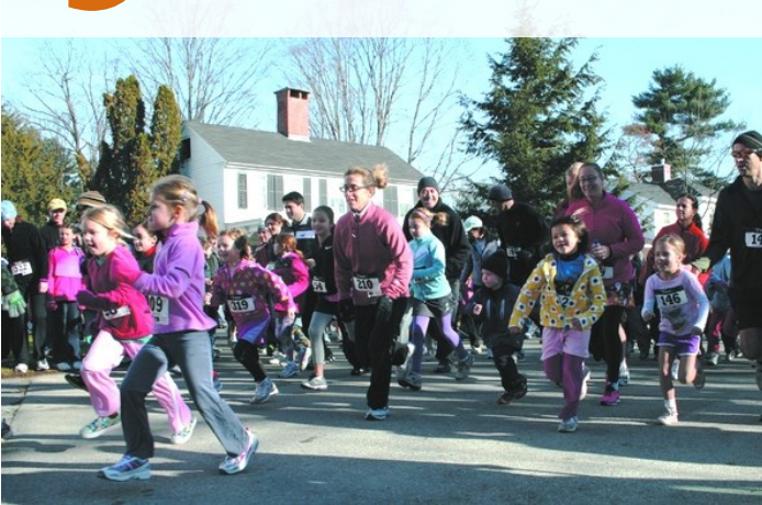
Road race on the Common, Amherst

In the NRPC Region, 7 out of the 13 communities mention promoting recreational activities and facilities .