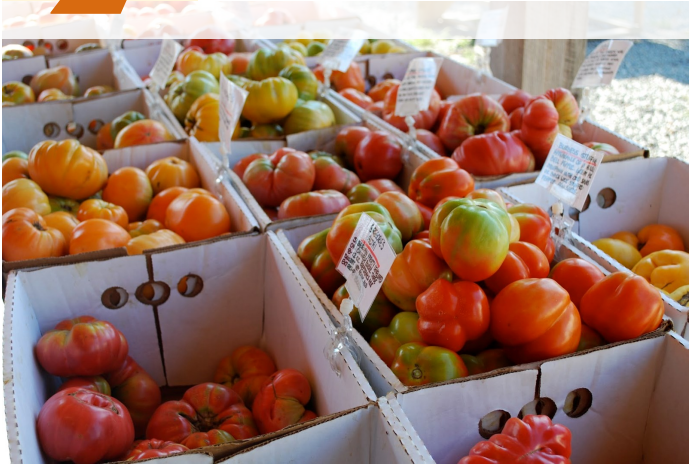
Lull Farm, Hollis