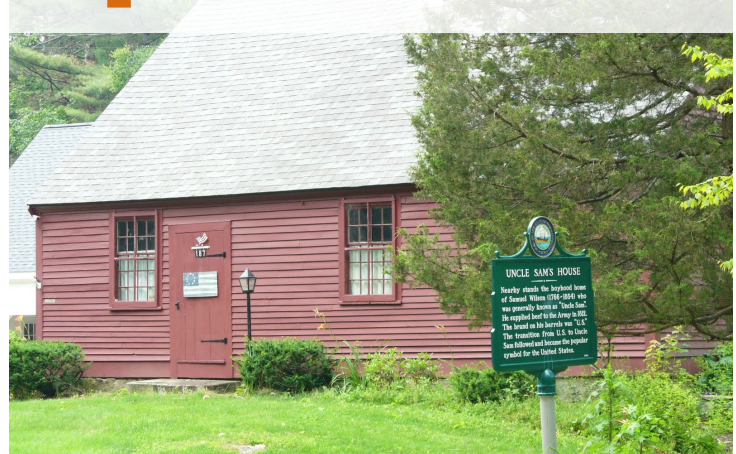
Uncle Sam's House, Mason

All NRPC communities address historic preservation in their Master Plans