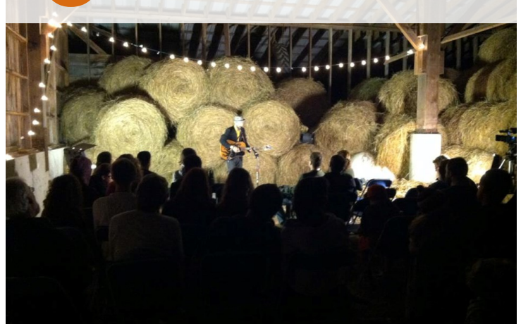
Concert at Hilltop Café, Wilton

In the NRPC Region, 5 out of the 13 communities mention promoting cultural and art events.