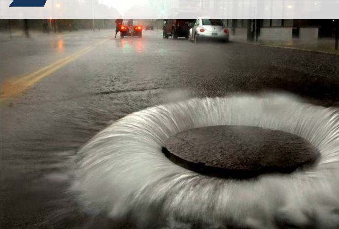
Storm water overflow