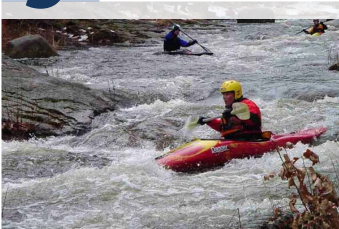
Paddler on Souhegan River

8 of the 13 NRPC communities have a goal to educate the public on the importance of water quality and preservation.