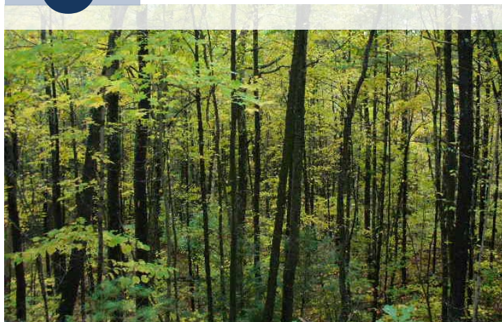
Forest in Hollis

In the NRPC Region, 6 out of the 13 communities mention quality of wetlands in their master plan.