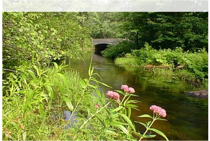
Nissitissit River, Brookline

9 out of the 13 NRPC communities mention protecting existing water infrastructure in their Master Plans