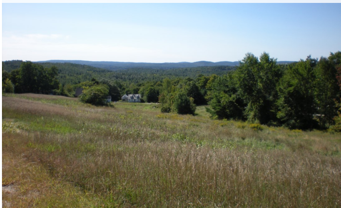
Pasture in Mont Vernon

In the NRPC Region, 11 out of the 13 communities mention acquiring land for conservation and habitat protection.